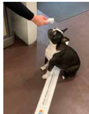
Everyone gets their temperature checked. Even our OFFICE MAX! (I think he thought it was a piece of chicken)