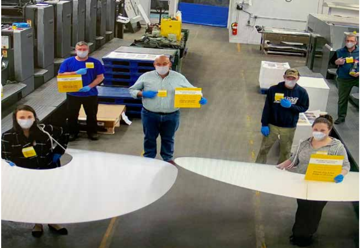
Showing off our new mandatory attire that include label stickers reminding everyone, it is safer if we talk 6 feet apart. The ladies are demonstrating how far 6 feet really is.